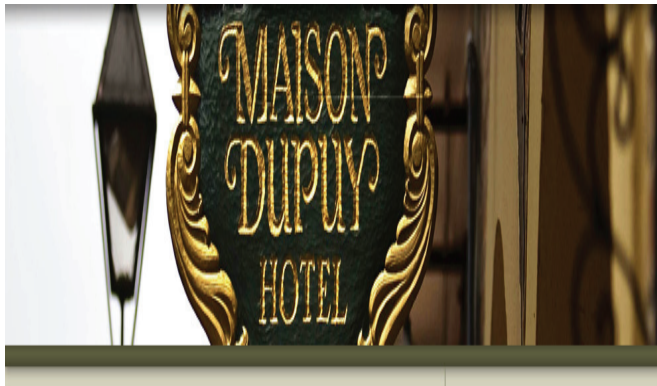
Maison Dupuy Hotel, New Orleans

AT THE MAISON DUPUY HOTEL, NEW ORLEANS AND ABOARD THE NORWEGIAN SPIRIT